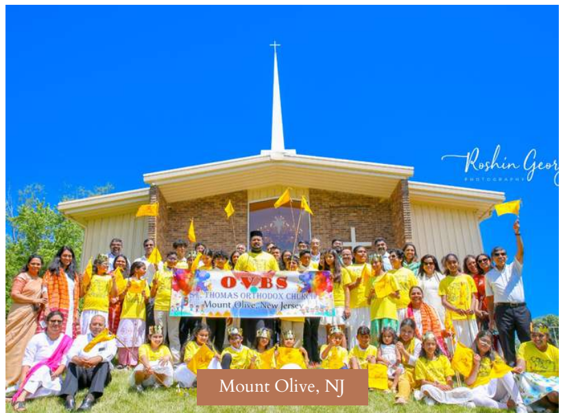
Mount Olive, NJ