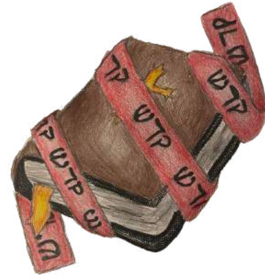
Illustration by Ava Mathew The writing in Hebrew refers to "The Holy Writ"

If we do not put our hearts and minds into what we read, it will be like clanging cymbals giving no meaning.