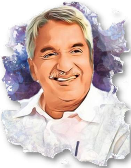
Late Mr. Oommen Chandy (1943-2023)

Although we are living in America, our roots are in India specifically the state of Kerala. Some of us were born and brought up outside Kerala and our knowledge of the state is limited. Here in America, we are all Malayalees and enjoy our culture and food. Our prayers and traditions are linked to our Indian roots. Two Kerala born saints (St.Gregorios of Parumala and St.Dionysius Vattasseril) lived in the last century who were role models for our church and others in the society. However, what is the status of our church now? Are we producing any saints or people like that? The answer to this question comes in the form of a pious Malankara Orthodox Christian Mr. Oommen Chandy, a well known politician and former chief minister of the state of Kerala.