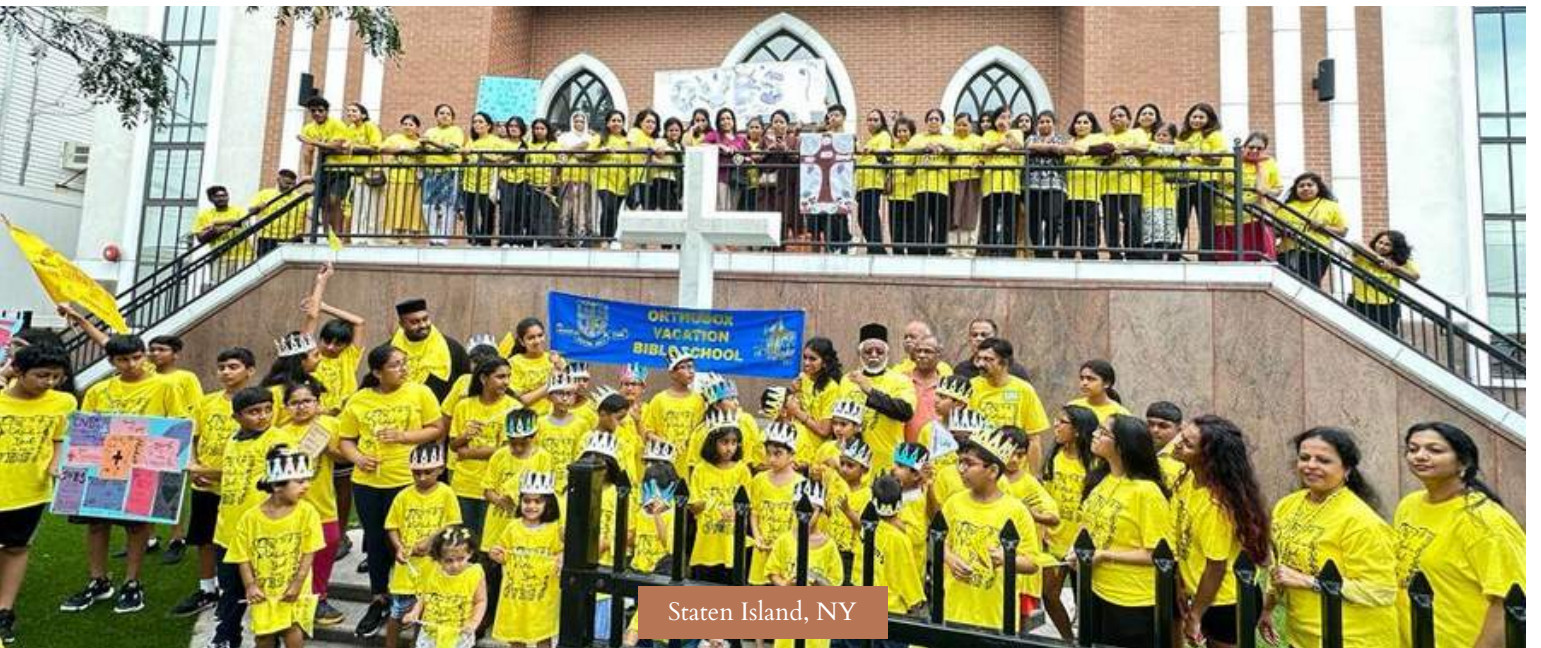
Staten Island, NY